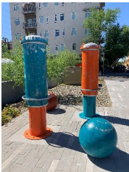
Laurie Lundquist Spinning Stories

Over the last month two new AIPD projects have been installed in downtown Tempe. Along 5 th Street adjacent to the Vib Hotel, artist Laurie Lundquist created a new work that bring sound, light, and color to the new development. The work is inspired by the history of the site as a citrus packing facility and has both a night and day presence. Each sculpture has a handle that allows participants to turn, releasing a musical sound and allowing the images to form a spinning narrative.