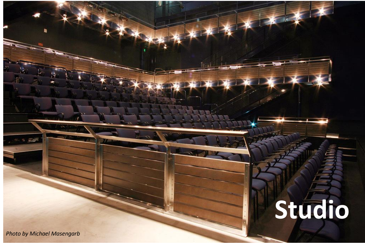
Seating capacity 220 or 257 with flat floor conversion // Dressing room capacity 25