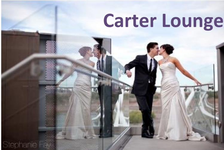
Stephanie Fay Photography