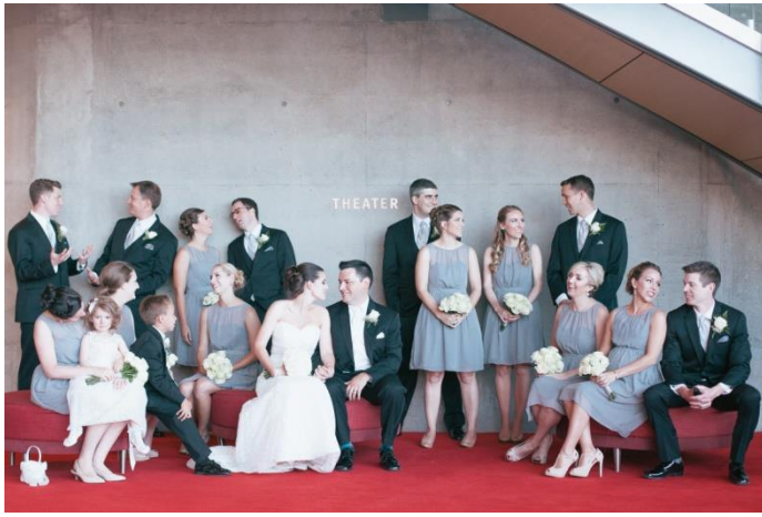
April Maura Photography