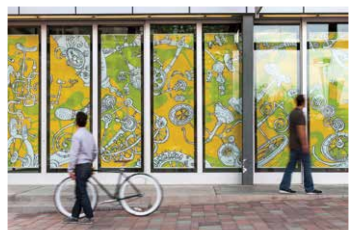
Artist: Pete Goldlust; Cycle Ops Location: Tempe Transportation Center

For more information or to use our online map to tour the collection, visit www.tempe.gov/PublicArt.